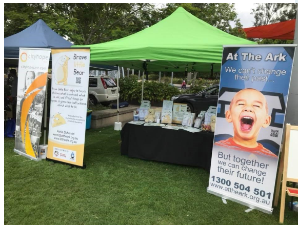
Picture: Child Protection Week in September