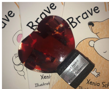
Picture: Award received