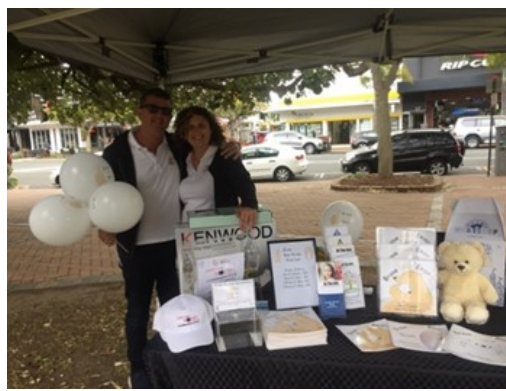
Picture: Child Protection Week