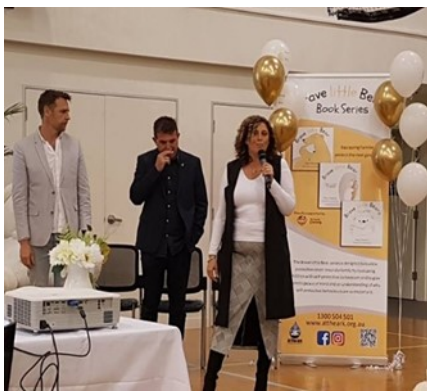
Picture: At The Ark Book Launch