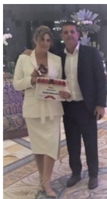
Picture: With the award