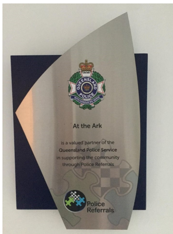
At The Ark is now officially a provider for the police service to refer too.